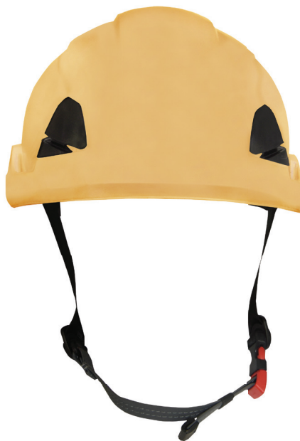
(Front with Chin Strap)