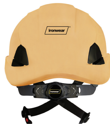
(Back with Ratchet)